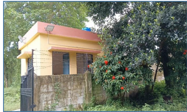
Halisahar Land Parcel, Kolkata