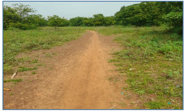
Padianallur Land Parcel