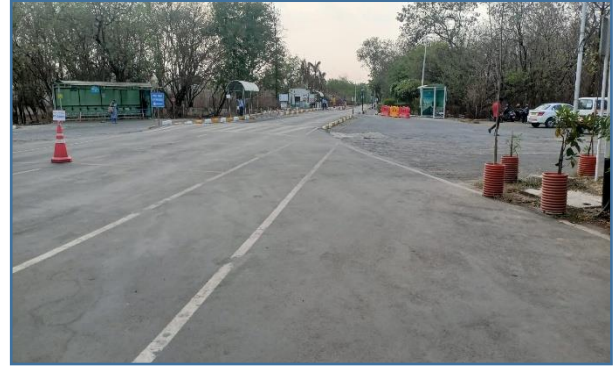
Pune Land Parcel