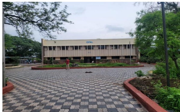
Infrastructure on Pune Land