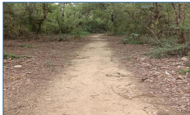
Greater Kailash Land Parcel