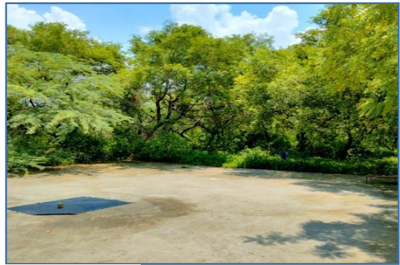
Chattarpur Land parcel